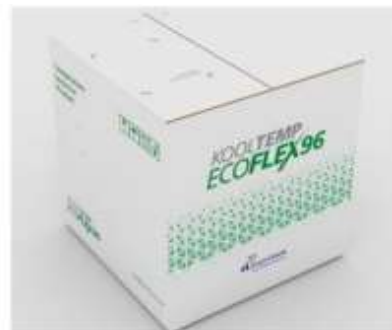
Step 5: Fold in the original outer flaps. Fold in the remaining flaps with return.