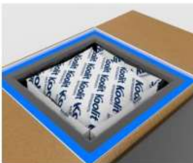
Step 4: Place the top PCM gel pack(s) back on top.