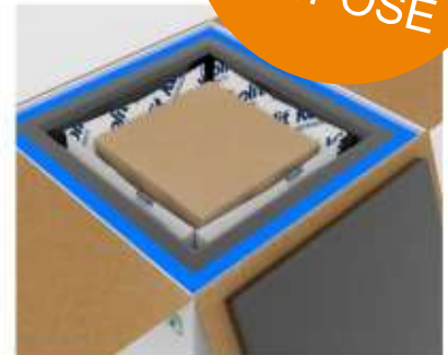
Step 3: Ensure the inner corrugated box is back in the EcoFlex shipping system.