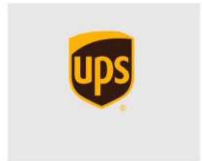
Step 6: Schedule a pickup with UPS. Contact UPS either by phone or by email.