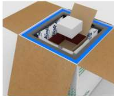
Step 2: Remove the product(s) from the inner corrugated box.